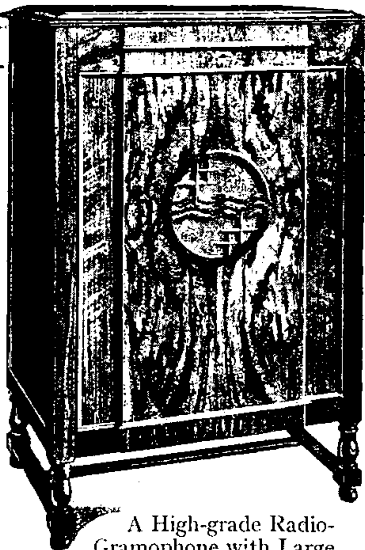
A High-grade Radio-Gramophone with Large Output and Many Refinements.

It will be observed that decoupling is unusually complete, as a double filter arrangement is included in the first grid circuit and in series with the detector anode. Valve rectification is provided for the H.T. supply, and there is a separate rectifier for the loud-speaker field.