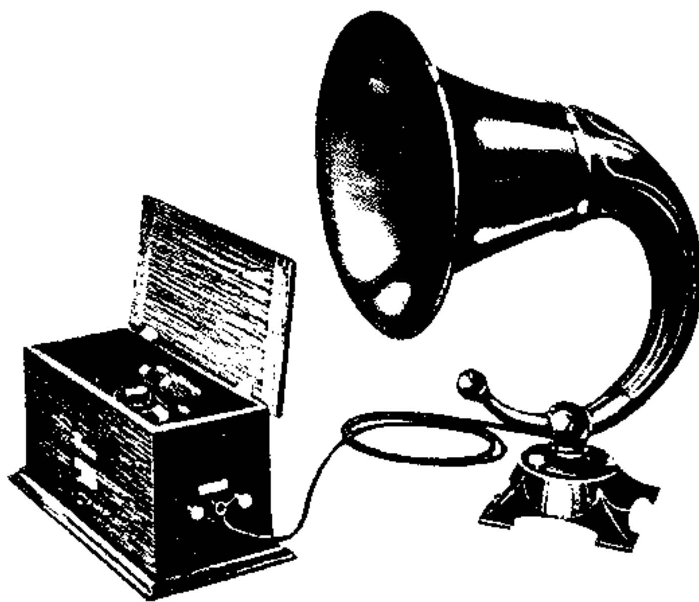
The new "Brown" Ideal Wireless Set

Look at the map shown on the next page. Here we have indicated the centres throughout the country in which the "Brown" Ideal Wireless Set will operate successfully. The larger circle in the Midlands, of course, represents the Daventry area; while the medium-sized circles are indicative of the 15 miles radius of the main broadcasting stations. The smaller circles represent the seven